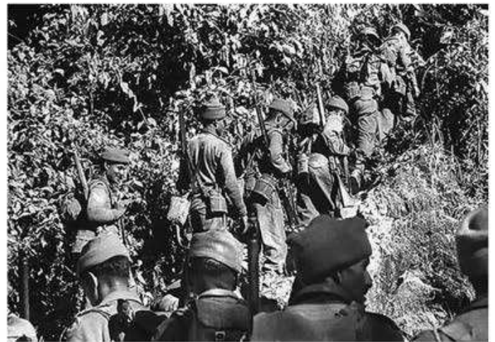
India-China War 1962

So after a recee, I deployed the 1 Sikh LI on the left flank with their 4 companies and retained the 5 Guards in a depth position. Battalion parties went to prepare camps for company localities.