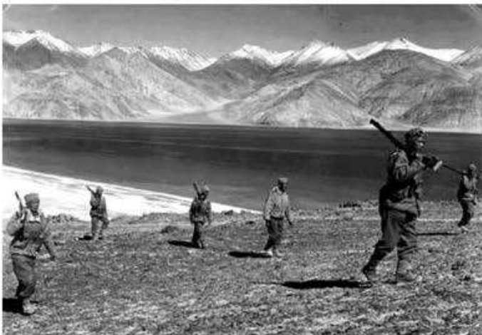
India-China War 1962

T he 48 brigade was in Ambala, training for an operational role in Punjab when in October, maybe 22nd or 23rd, we were ordered to proceed with two battalions to Tezpur. We reached in about 2–3 days on October 26 and reported to the Corps HQ and were asked to proceed to Bomdi La with whatever transport we could lay our hands on. At Bomdi La, 1st Madras was already in position and the rest of the area devoid of troops.