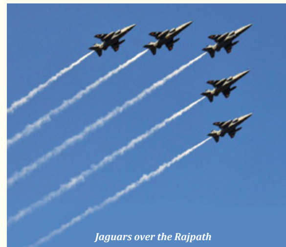
Jaguars over the Rajpath

Despite its creditable performance in recent exercises like Gagan Shakti and the Air Power Display at Pokhran followed swiftly by actual operations over Balakot and its aftermath on 26 and 27 February respectively (see Vayu Issues II and III/2019 ) the Indian Air Force is undoubtedly facing a severe crisis in terms of its depleted combat numbers. Against its sanctioned strength of 42 combat squadrons, it is progressively and effectively down to about 30 squadrons while the security challenges facing the nation and its first responder, the IAF, have only continued to grow. Modernisation of the Chinese military including its air force (PLAAF) and the navy (PLAN) along with growing strength and modernisation of the Pakistan Air Force (PAF) albeit with Chinese support, have made the threat of a two front confrontation, even if not a full-scale war, a realistic possibility for India. As a matter of fact, with rapid growth and unprecedented modernisation of the PLAN, there is distinct possibility that a hostile situation could easily confront the IAF with concurrent threats on three fronts, the third being in the maritime domain with increasing presence of PLAN in the Indian Ocean.