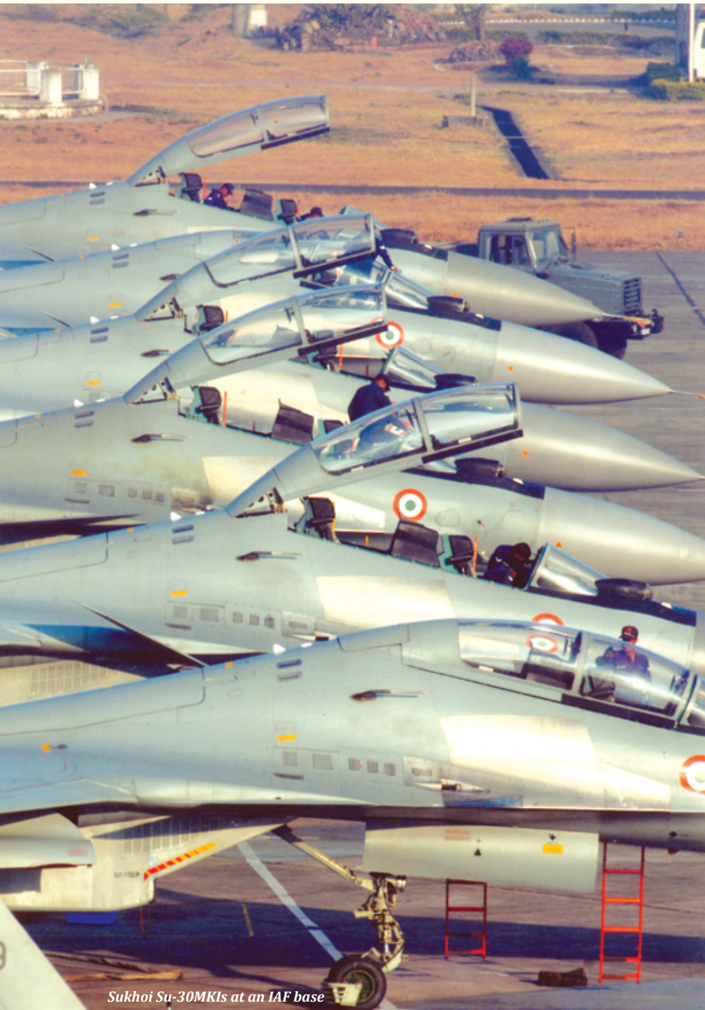
Sukhoi Su-30MKIs at an IAF base

The IAFs depleted strength: causes and remedies