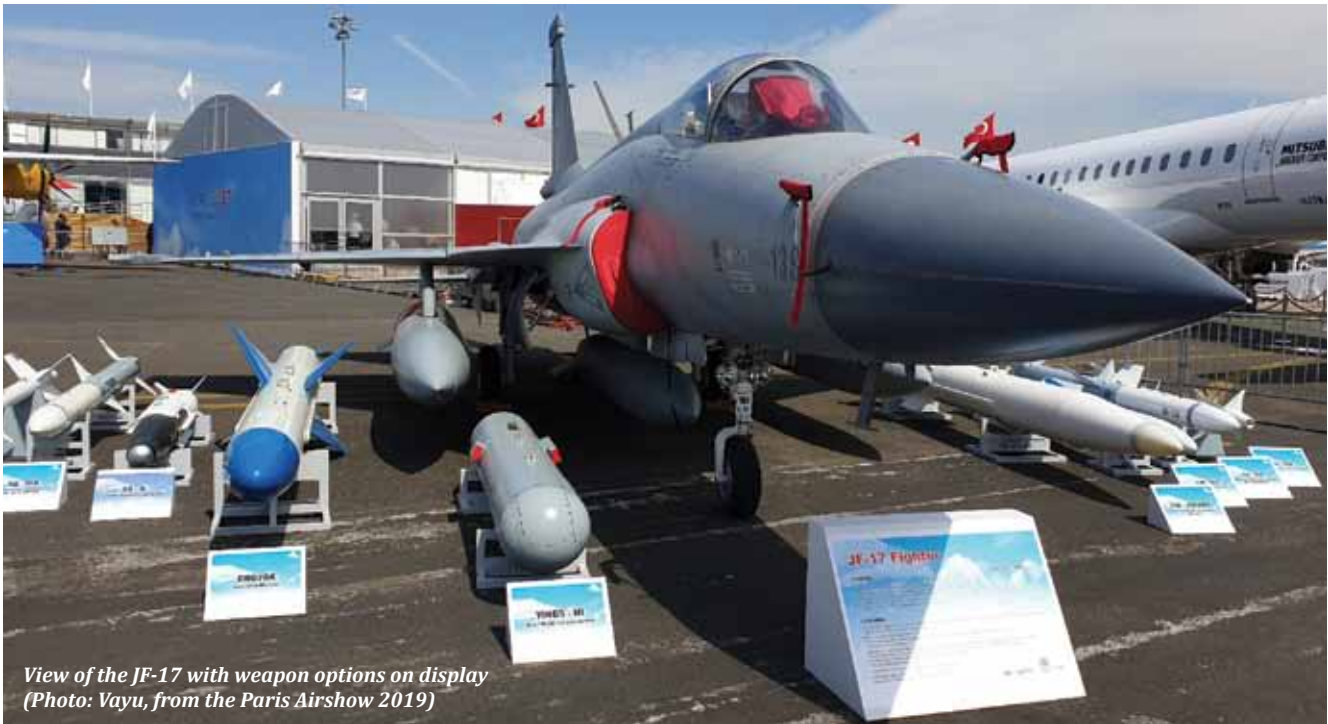
View of the JF-17 with weapon options on display (Photo: Vayu, from the Paris Airshow 2019)