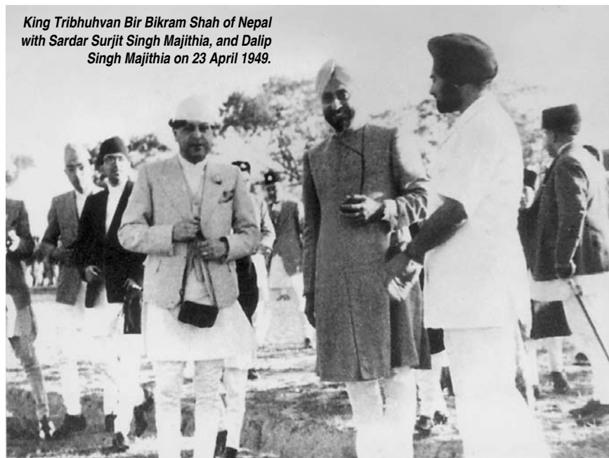
King Tribhuvan Bir Bikram Shah of Nepal with Sardar Surjit Singh Majithia, and Dalip Singh Majithia on 23 April 1949.

"Coming into Nepal, I don't think you will have to climb very high because if you check on your route from Muzaffarpur to this place straight, you practically come along the river Bhagmati and enter the valley along the river and you fly in between the high mountains, 8,297 ft on one side and a little over 9,000 ft on the other, and so if you come in between these two ranges and follow the course of the river, you will