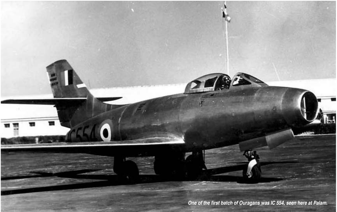
One of the first batch of Ouragans was IC 554, seen here at Palam.