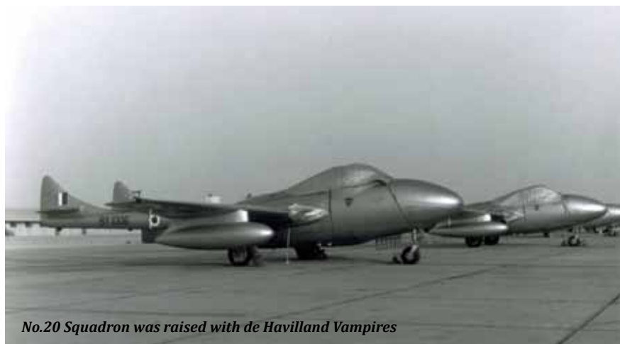
No.20 Squadron was raised with de Havilland Vampires

raised in 1956, only one other person present (my wife) knew that she and I had also been married in 1956! Amongst the loud cheers and popping of champagne corks, one voice called out: "Then sir, this is your second Diamond Jubilee this year!" Too true and we could not have asked for a better occasion to celebrate it again.