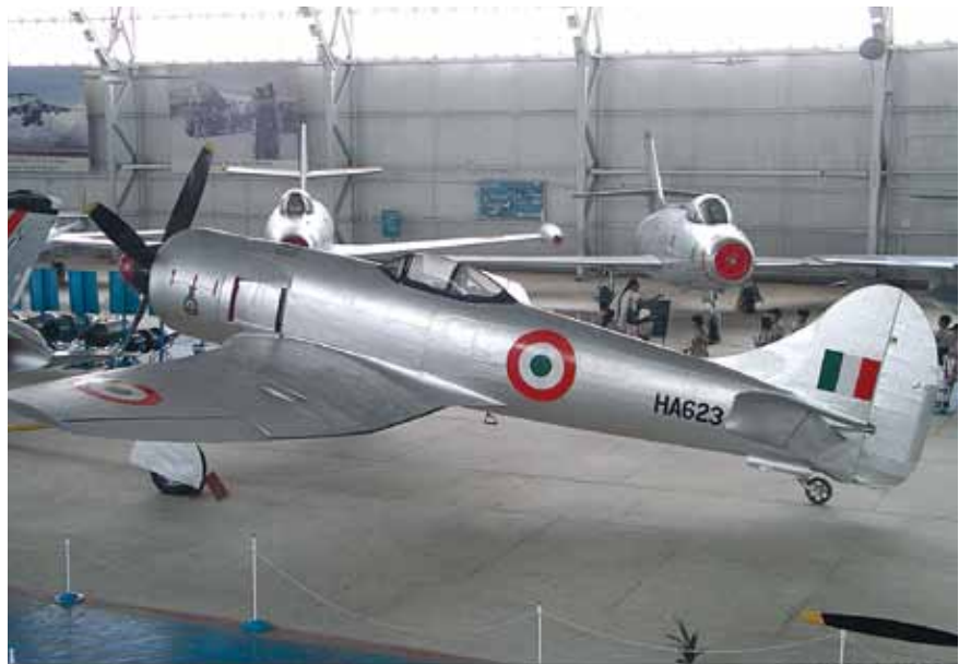
The Hawker Tempest Mk2 seen here at the IAF museum at New Delhi

A few of us new coursemates with a boarding school background, were comfortable with the rules, regulations and routine of life at the AFA. The daily schedule divided itself into ground subjects in the class room, drill on the parade square and flying in the fabric-covered, propeller-driven biplane in which the instructor sat in the front and the pupil at the back. As a youth used to regular games in the evenings, I was a little disappointed at the lack of facilities or emphasis on organised team games. However, our Chief Ground Instructor (CGI) was a keen tennis player and, a couple