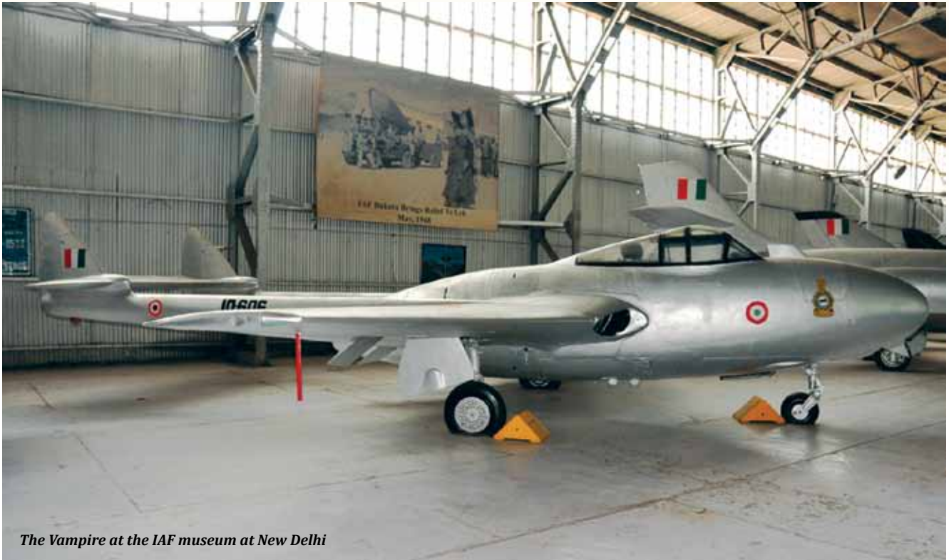
The Vampire at the IAF museum at New Delhi