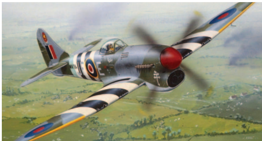
Representative image of the Tempest

Finally, on 22.11.2022 (provided I am destined to reach that date), I will join the nonagenarian club. 90 will be a milestone that marks our ongoing happy family life, a rewarding professional life (both in the air and on the ground) and a fulfilling retirement. This fortunate writer is grateful for having reached 2022..... and life goes on.