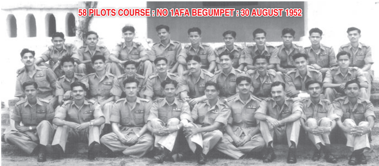
58 PILOTS COURSE : NO 1AFA BEGUMPET : 30 AUGUST 1952